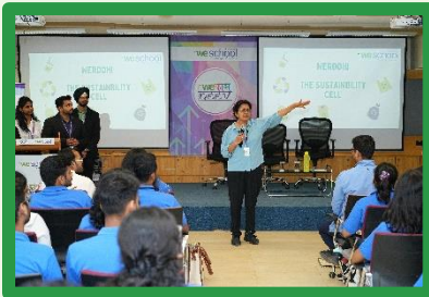
Introduction of WeRddhi Cell to Batch of 2024-26, 20 Aug 2024