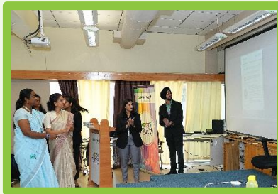
Launch of First ESG Newsletter at NEEV-24, 20 Aug 2024