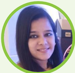
Account Director, ESG & Investor Relations, Adfactors PR