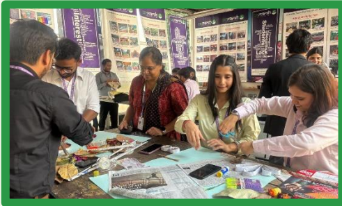
Upcycling Activity at Protolab Recycle Day, 18 Mar 2024