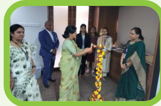
Launch of WeRddhi 26 Feb 2024