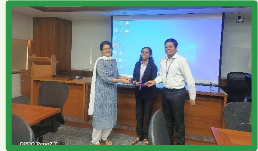
Case Study Competitions World Water Day, 22 Mar 2024