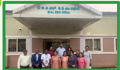
Visit to Kempegowda International Airport Bengaluru, 03 May 2024